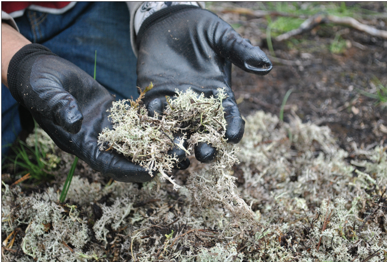
Fig. 3. Example of a field technician shredding the lichen into fragments.

lected when moist, and water droplets formed immediately on the interior of the bags. If molding or rot was suspected, our team was prepared to air dry the lichens and discard rotting material. Due to the short duration between lichen collection and transplanting, molding was not an issue during our project.