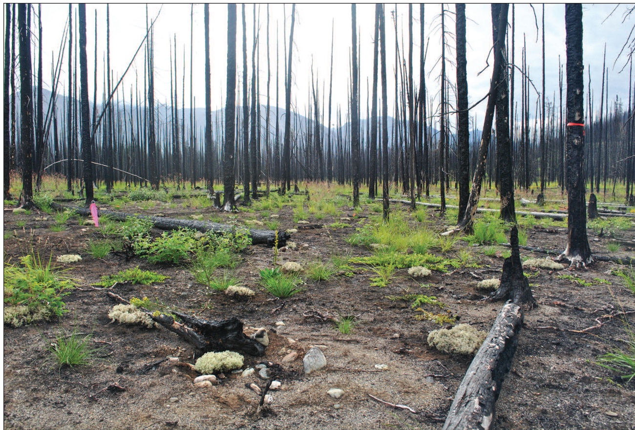
Fig. 4. Example of the mat treatment.

were brushed onto the ground. With the mat treatment, technicians used intact pieces of lichen (the size of a clenched fist to an outstretched palm) and placed these lichen with the basal area oriented downwards. The approach was similar to that of tree planting, as technicians worked to obstacle mats around logs, stumps and other immovable objects (Fig. 4), and the substrate was pulled around the edge of the mat. This approach is based on the results of Enns (1998) who noted that transplanted lichen colony survival was “associated with shelter from large logs (coarse woody debris).” This technique is best described as ‘gardening’ as each mat was planted, whereas the fragments were broadcast. The fragment treatment was more efficient to distribute. Two technicians took < 5 minutes to distribute fragments over 100 m 2 , whereas the mat treatment took two technicians 10–15 minutes to evenly distribute over 100 m 2 . With little instruction, all technicians and volunteers were able to obstacle mats and distribute fragments with ease. While vehicles were used to transport the lichen along forest roads, reducing the volume of lichen within each bag made traversing to the study area safer for technicians.